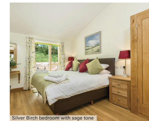
Silver Birch bedroom with sage tone