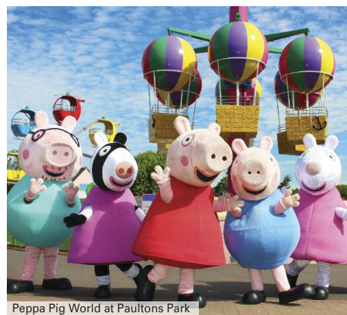
Peppa Pig World at Paultons Park