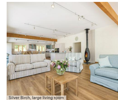
Silver Birch, large living room

Our new sauna and steam room will be ready in 2020 along with a games room and space for yoga retreats. We've launched amazing experience packages so check out our website and subscribe to our newsletter for up-to-date details of everything that's happening, at and around Wallops Wood!