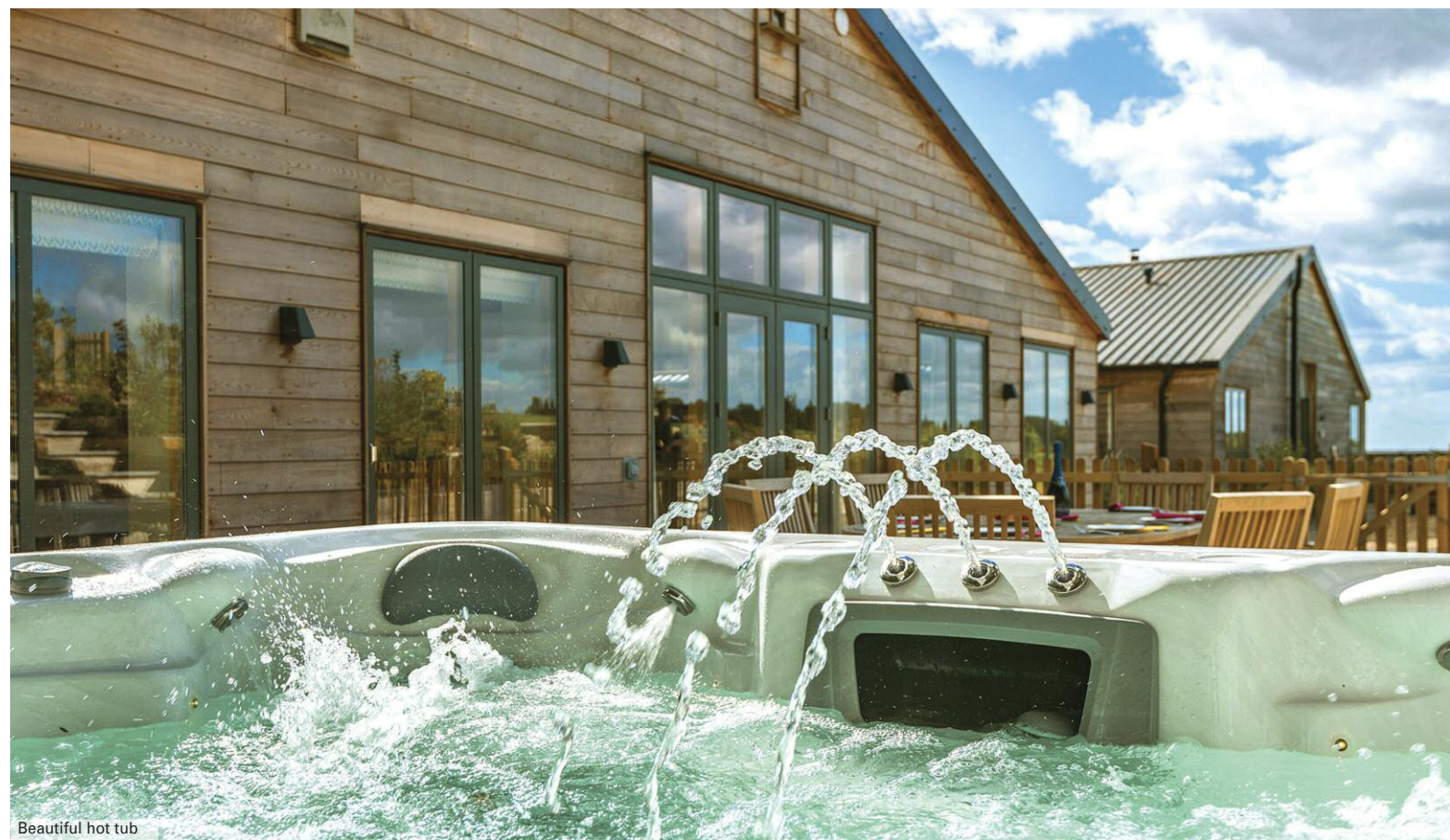
Beautiful hot tub

Award-winning cottages with swimming pool in the South Downs National Park