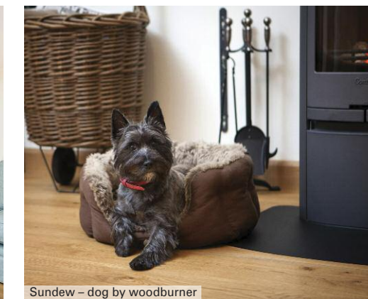
Sundew - dog by woodburner