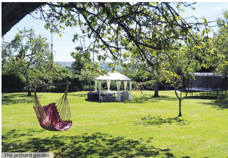
The orchard garden

Award-winning country cottages – a perfect location to explore South Devon