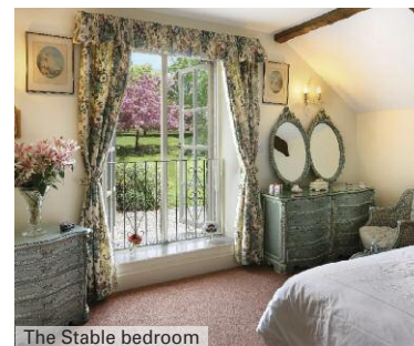
The Stable bedroom

In the peaceful hamlet of Aish, these three award-winning, luxurious cottages have been lovingly converted to very high standards. The perfect location to relax, and explore South Devon.