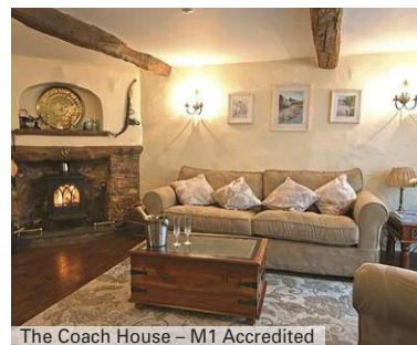
The Coach House – M1 Accredited