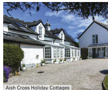
Aish Cross Holiday Cottages