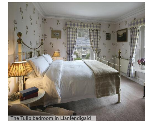
The Tulip bedroom in Llanfendigaid