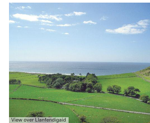
View over Llanfendigaid

Opportunities abound nearby for walking, golf, sailing, bird watching, climbing, touring cycling and mountain biking. Nearby Tywyn (5 miles) has a sand and shingle beach and is the terminal of the Talylyn Railway, one of the famous 'Little Trains of Wales'. Aberdyfi (7 miles) has a first rate golf course, excellent sailing, good pubs and 5 miles of golden sand and dunes. We can arrange full or partial catering, if required, for any of the cottages. Two well-behaved dogs are welcome in Stable Cottage and The Cow Shed only.