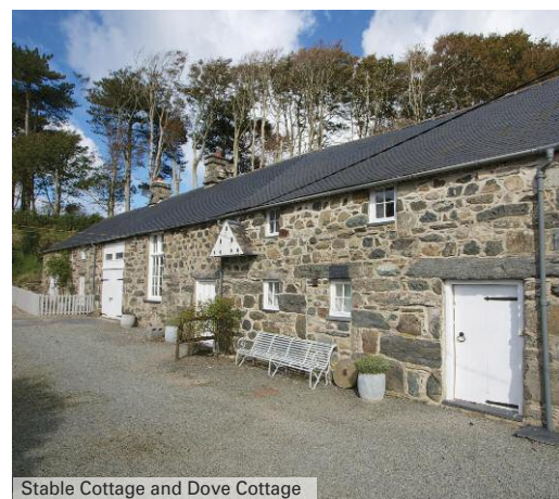
Stable Cottage and Dove Cottage