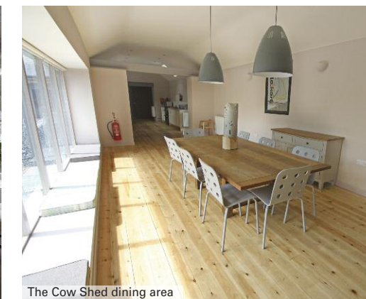
The Cow Shed dining area