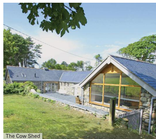
The Cow Shed