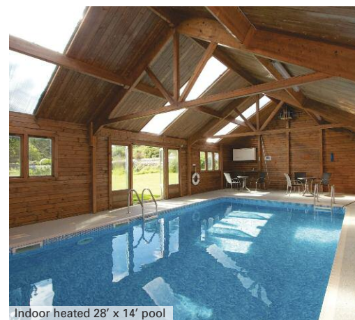
Indoor heated 28' x 14' pool