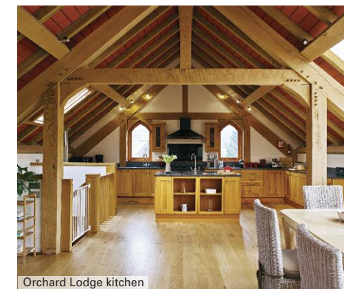
Orchard Lodge kitchen