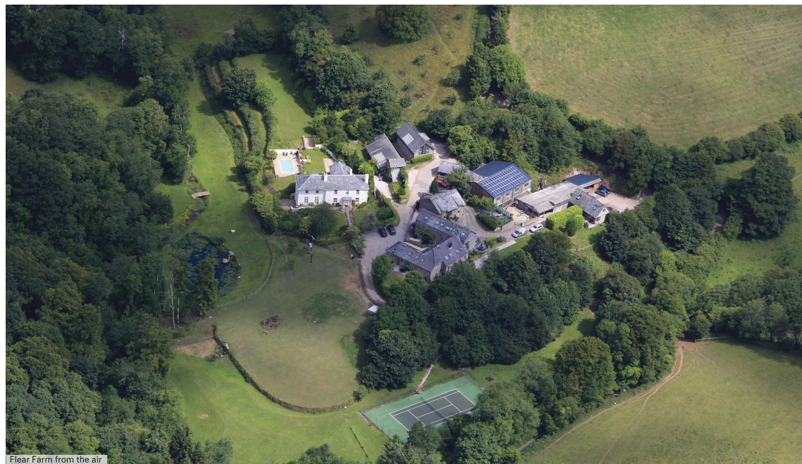
Flear Farm from the air

In the glorious South Hams, stunning coastline and lots of sandy beaches