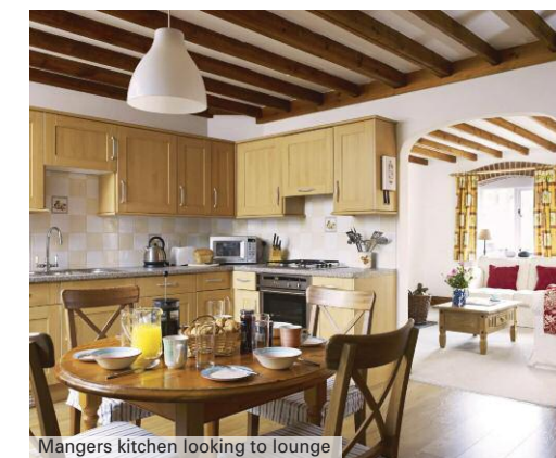
Mangers kitchen looking to lounge

For detailed information and photos please visit our website.