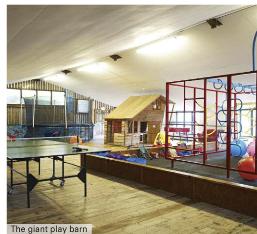
The giant play barn