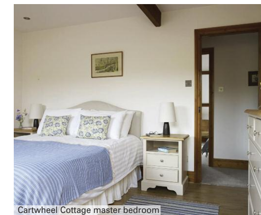
Cartwheel Cottage master bedroom