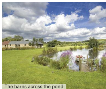
The barns across the pond