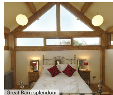
Great Barn splendour

Easy living. Welcome to Kempley Barns luxurious contemporary accommodation, surrounded by acres of orchards and wild flower meadows, set in the beautiful countryside of Herefordshire and Gloucestershire. A truly breathtaking location!