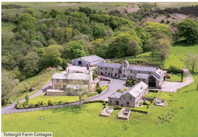
Tottergill Farm Cottages

The perfect place to recharge your batteries