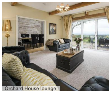
Orchard House lounge