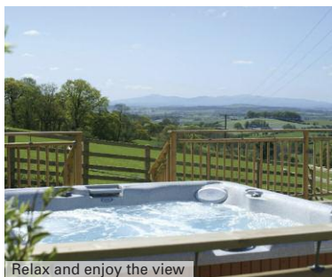
Relax and enjoy the view

Our aim is to provide the ultimate place to rest and refresh and we hope you'll find that to be true as we welcome you to our little piece of rural tranquillity.