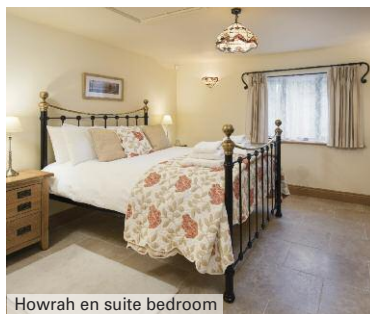
Howrah en suite bedroom