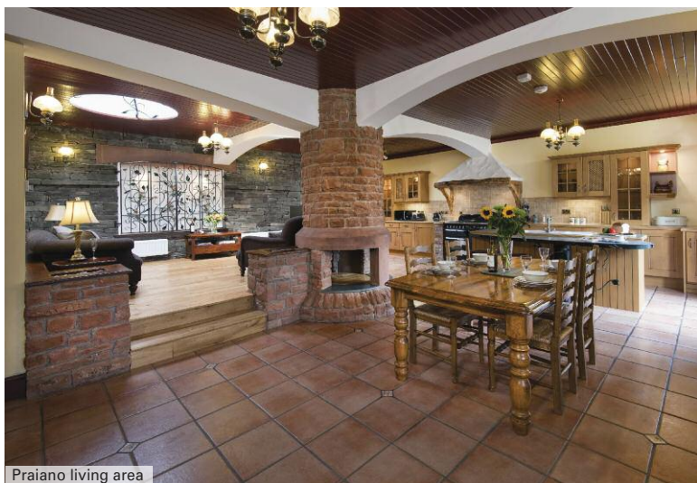
Praiano living area