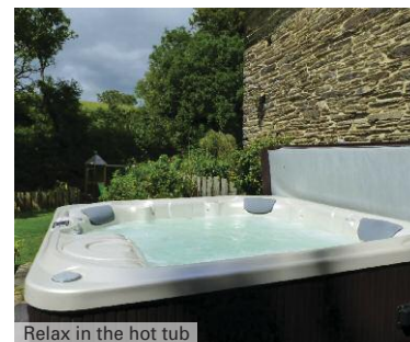
Relax in the hot tub