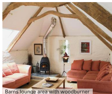
Barns lounge area with woodburner