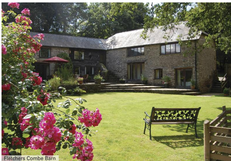
Fletchers Combe Barn

Welcome to Fletchers Combe. Spacious and refined accommodation set in a secluded valley. A superb location for large gatherings.