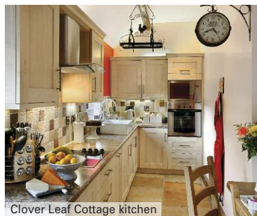
Clover Leaf Cottage kitchen