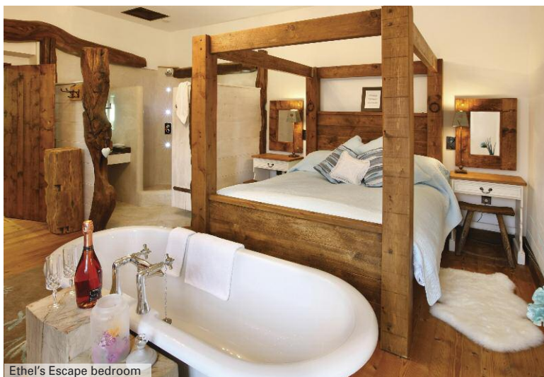
Ethel's Escape bedroom

Nestled at the foot of the stunning Yorkshire Wolds are five cottages beautifully converted from old barns, stables and dairies in a peaceful village close to historic York.