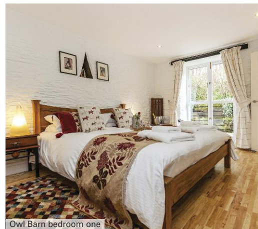
Owl Barn bedroom one