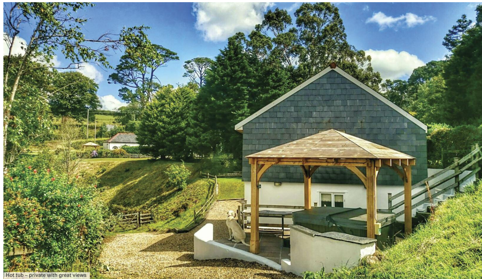
Hot tub – private with great views

Four award-winning, luxury, dog-friendly cottages with private hot tubs