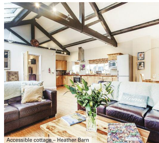
Accessible cottage – Heather Barn