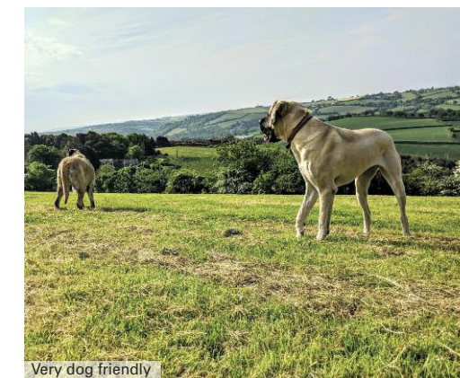
Very dog friendly