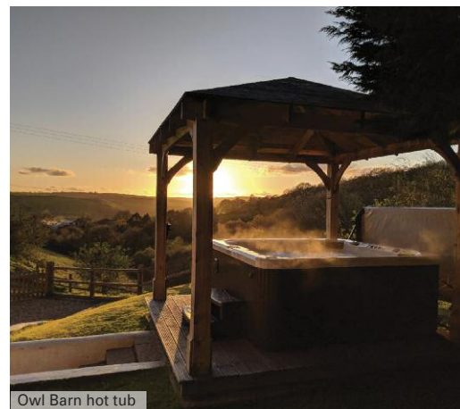
Owl Barn hot tub