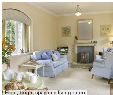
Elgar, bright spacious living room