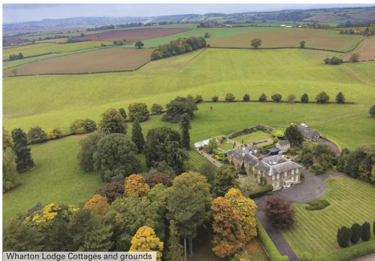
Wharton Lodge Cottages and grounds

Perfect rural location near Ross-on-Wye, adjacent to the Forest of Dean