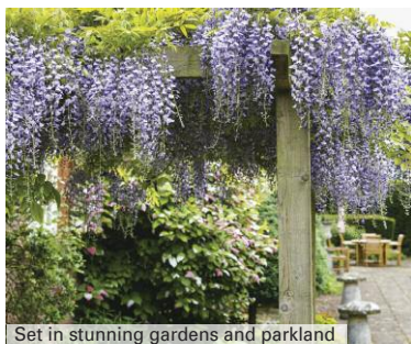
Set in stunning gardens and parkland