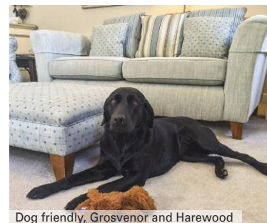
Dog friendly, Grosvenor and Harewood

Three beautiful cottages surrounded by manicured gardens and parkland, provide comfort and tranquility for couples or small groups. An idyllic place for romantic escapes, short breaks or longer relaxing holidays.