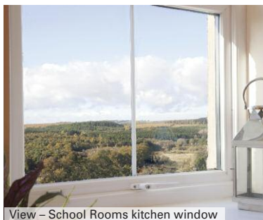
View – School Rooms kitchen window

Associated with 'Forest Barns', a sister site – 6 minutes' drive (see page ???)