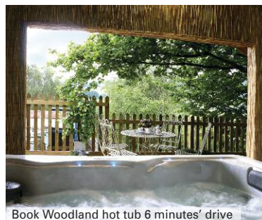
Book Woodland hot tub 6 minutes' drive