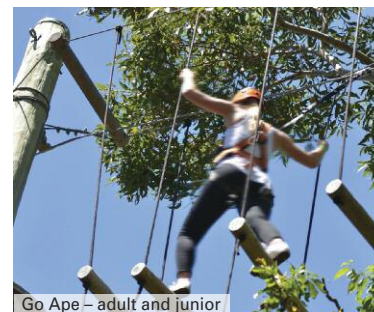
Go Ape – adult and junior