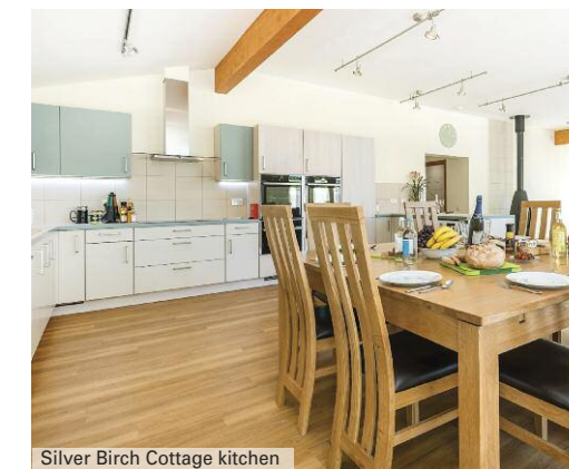
Silver Birch Cottage kitchen

There is plenty to do nearby from breathtaking walks direct from the door to visiting historic towns, great pubs, houses and gardens. We are close to popular attractions such as Portsmouth, Winchester, Paultons Park (incorporating Peppa Pig World) and Stonehenge. For more ideas, look at the 'Local Area' pages of our website.