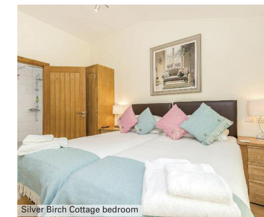
Silver Birch Cottage bedroom