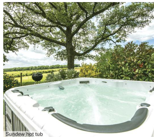
Sundew hot tub