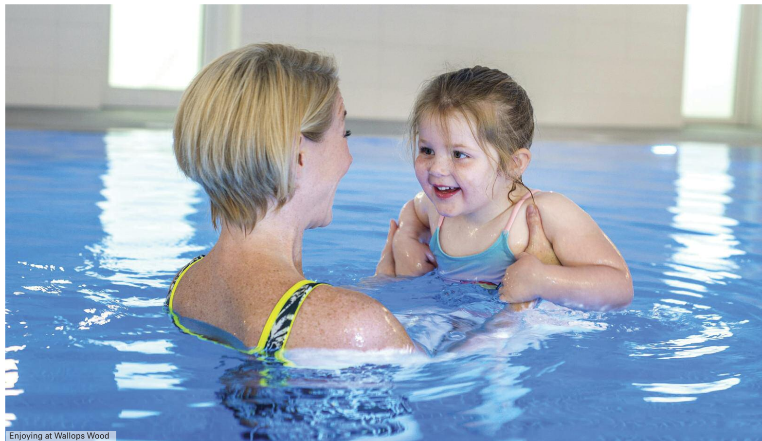
Enjoying at Wallops Wood

Award-winning cottages with swimming pool in the South Downs National Park