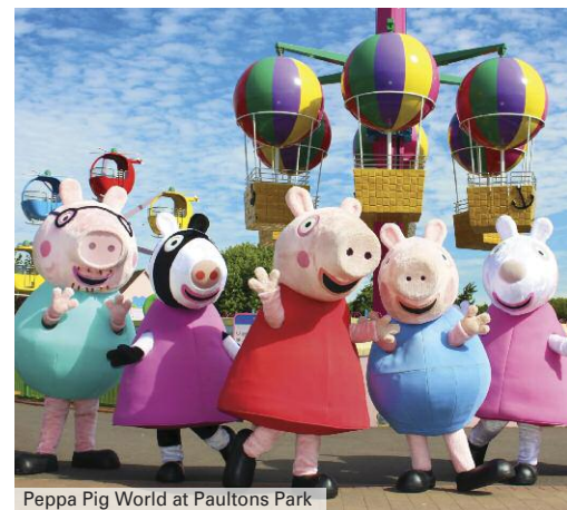
Peppa Pig World at Paultons Park