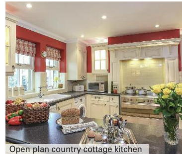
Open plan country cottage kitchen

Luxury cottage in coastal, medieval Warkworth