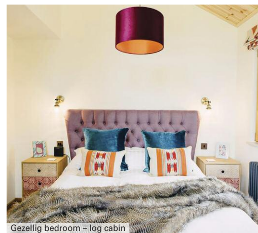
Gezellig bedroom – log cabin