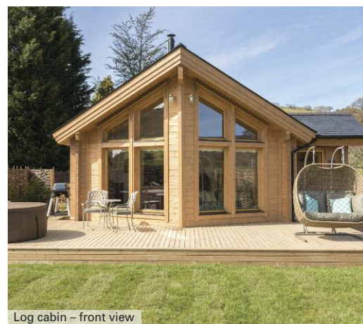
Log cabin – front view