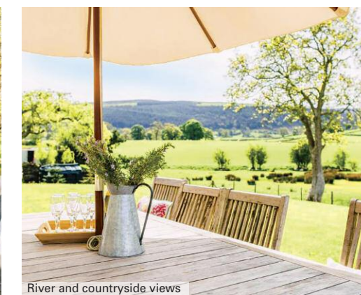
River and countryside views