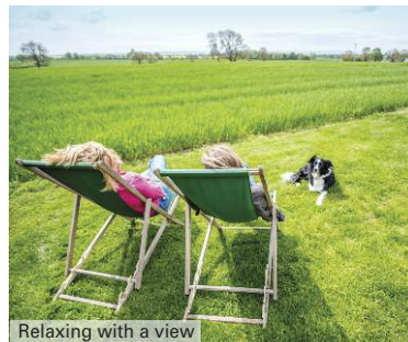
Relaxing with a view