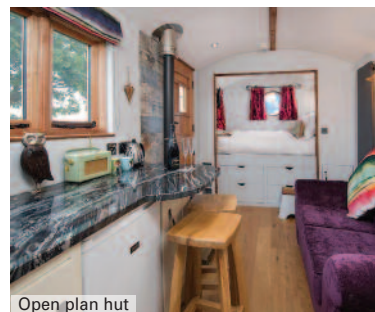
Open plan hut