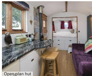
Open plan hut