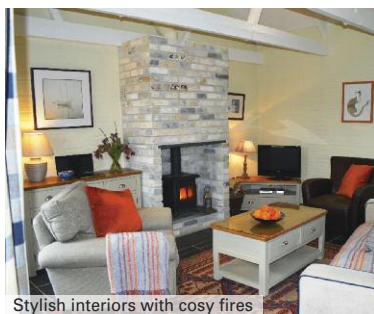
Stylish interiors with cosy fires