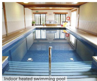
Indoor heated swimming pool