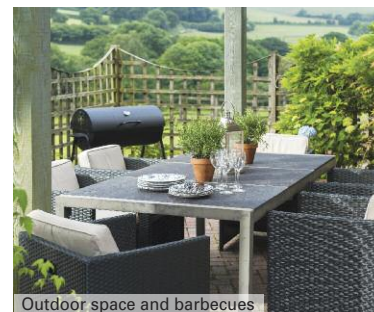
Outdoor space and barbecues