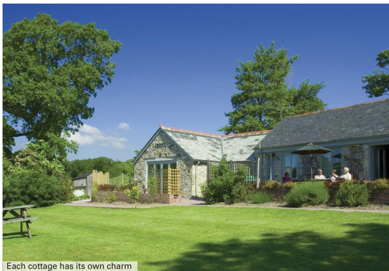
Each cottage has its own charm

Come, stay and play on a family farm in mid Cornwall, near the sea