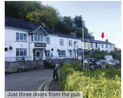
Just three doors from the pub

Fal River Cottage is the perfect dog-friendly getaway. This small, traditional, two-bedroomed cottage has stunning views, and has been popular with couples and small families since its renovation in spring 2019.