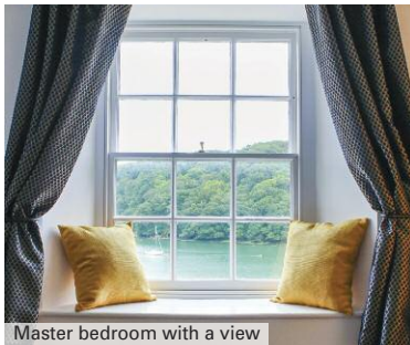
Master bedroom with a view