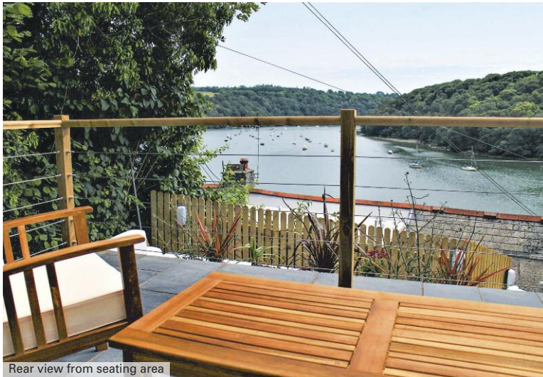
Rear view from seating area

Traditional, dog-friendly holiday cottage with tranquil river views