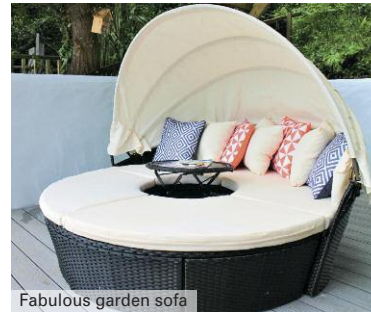
Fabulous garden sofa