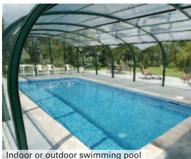
Indoor or outdoor swimming pool