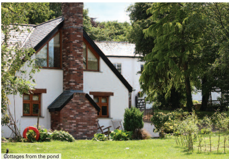
Cottages from the pond