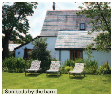
Sun beds by the barn